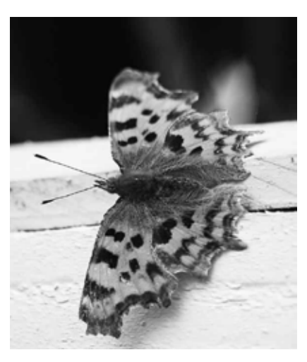
An increasingly uncommon sight, a comma butterfly in my garden in July.

and bees this year. They do of course self seed like there is no tomorrow, but to be sure of getting the same mix again next year, I'll be collecting seed heads just before they spill their contents all over the garden. (Anybody want any?) A challenge next year will be to see if I can get them to establish in a wild patch where I'm also growing various bulbs, foxgloves and evening primroses, in addition to the wild native plants that have gained a foothold. The grasses here