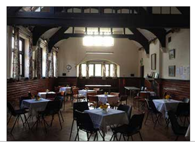
FREE Newsletter to Suckley Residents

THE TRUSTEES AND MANAGEMENT COMMITTEE OF THE VILLAGE HALL WISH ALL THE RESIDENTS OF SUCKLEY A MERRY CHRISTMAS AND A HAPPY NEW YEAR.